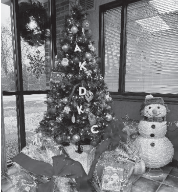
Congratulations to all the winners of our year-end holiday give-a-way

*Date is no later than 40 days prior to the Annual Meeting and adheres to the required 30 days that the board is required to provide members to submit a petition.